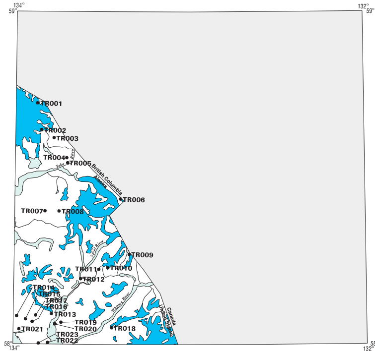
Distribution of mineral occurrences in the Taku River 1:250,000-scale quadrangle, Alaska

Descriptions of the mineral occurrences shown on the accompanying figure follow. See U.S. Geological Survey (1996) for a description of the information content of each field in the records. The data presented here are maintained as part of a statewide database on mines, prospects and mineral occurrences throughout Alaska.